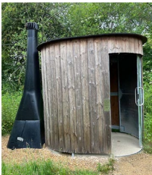
• Example of Kazuba Toilet at RSPB Fowlmere

MPC owns the land with the AA managing delivery of the projects.