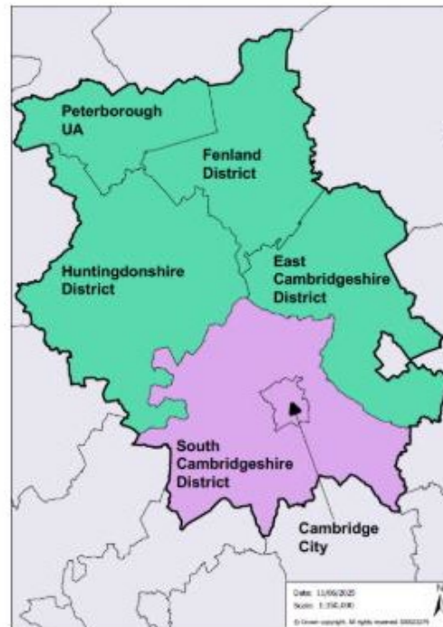
Map of LGR option B

In our area, two main options are in play for a future unitary authority. Very likely, South Cambridgeshire District will either merge with Cambridge City Council to form a “Greater Cambridge” unitary authority, or merge with Cambridge City and East Cambridgeshire to form a “South-East Cambridgeshire” unitary authority. While most other parts of Cambridgeshire would prefer to merge with the uniquely successful City of Cambridge, our area will very likely do so.