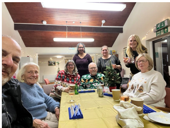
Games night at Vicarage Close