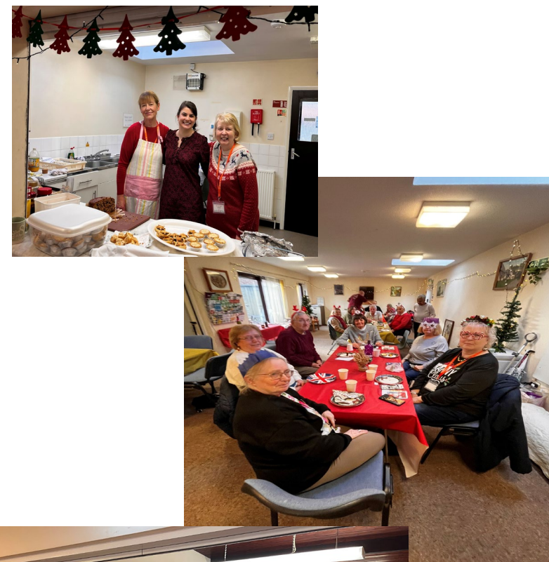
Afternoon Tea at Vicarage Close