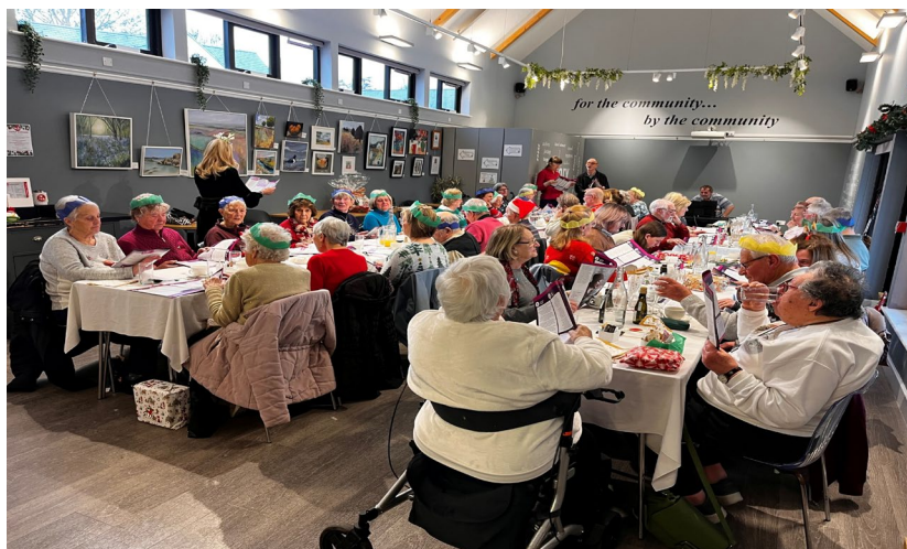
Christmas lunch at the Hub