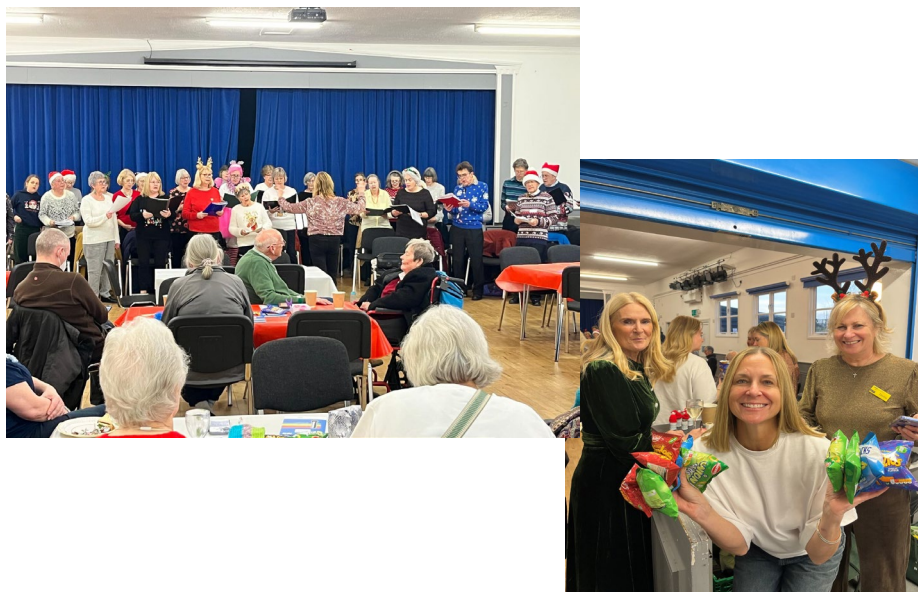
Memory Café at Meldreth Village