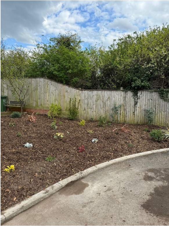
MA209/25a) Completed works to frontage of 77 Victoria Way