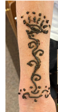
Seated Yoga and henna at Cozy Corner