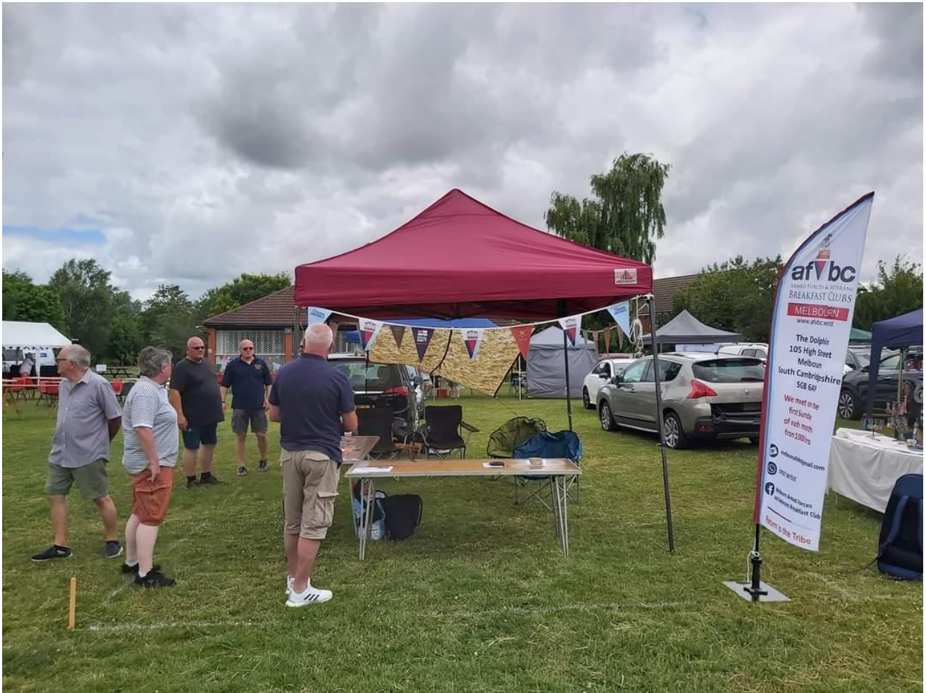
The stand with bunting, flag and pens at Melbourn Family Fun Day, June 2023

Melbourn AFVBC are very grateful for the grant awarded by Melbourn Parish Council; we have had 5 new members join us since June and continue to grow in number, supporting veteran and serving members of Melbourn. Thank you from us all.