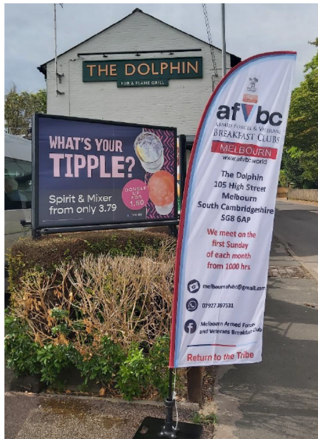
The flag outside the Dolphin during a breakfast club meeting