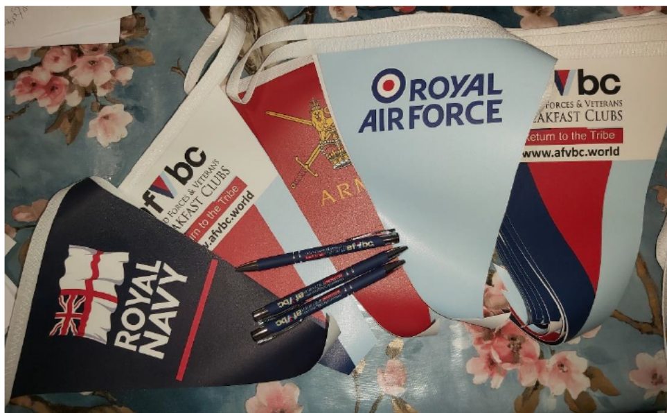
The bunting and some pens