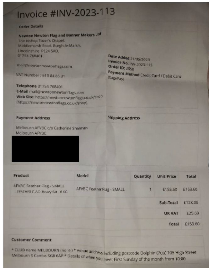
The invoice for the flag