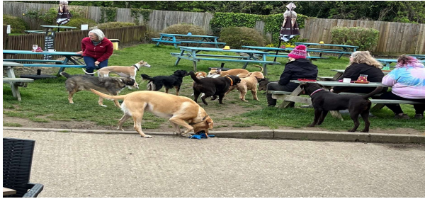
Dog Café fun at the Dolphin