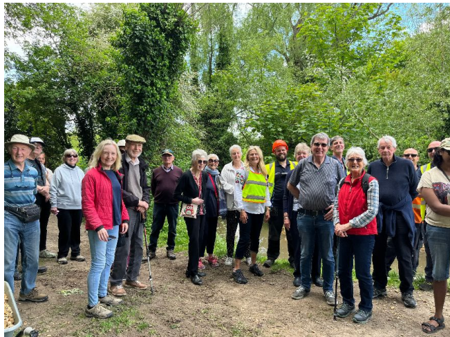
Wellbeing Walkers visiting River Mel project