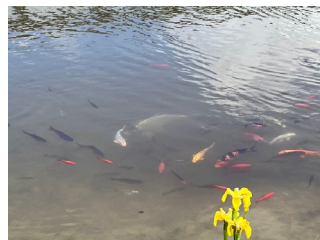
Science park walk and Seeds donated to Timebank members