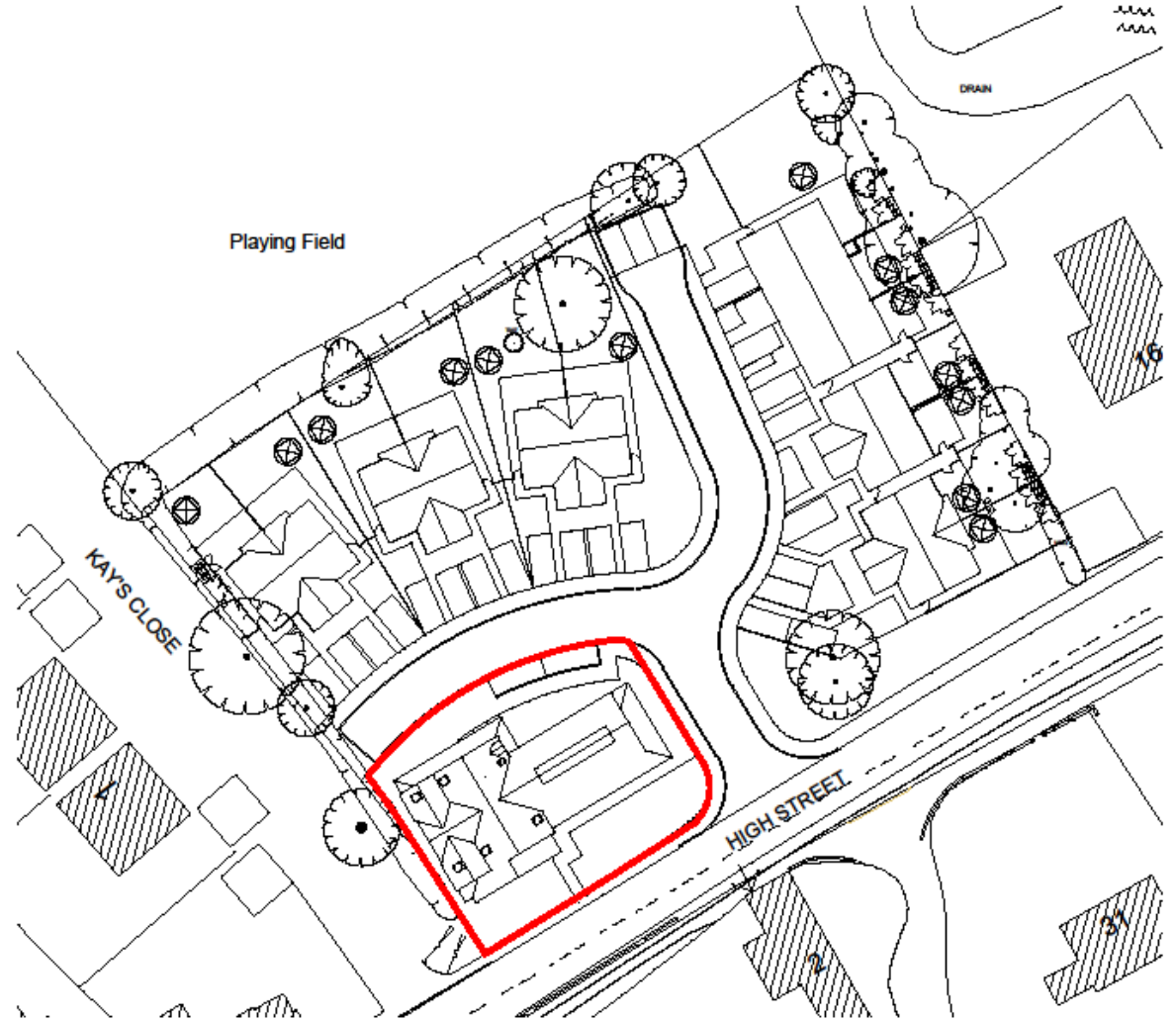
02 Proposed Site Plan 1:500