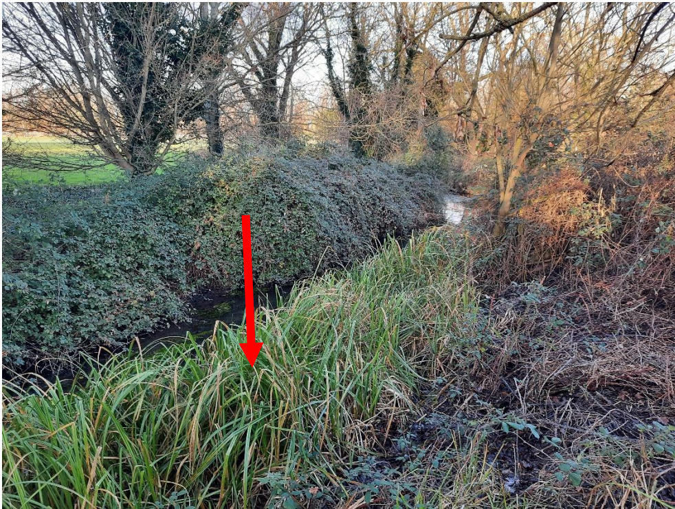
Bramble at ground level to be strimmed/flail cut, retain all marginal sedge growth (red arrow). Rob Mungovan supported by RMRG volunteers to cut bramble growth from within river. RMRG vols to plant sedge into opened-up areas.