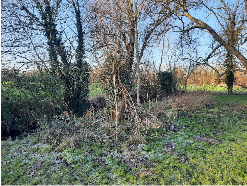
Hard strim/flail cut top of bank and slope every 3 years, retain fringe at water level.