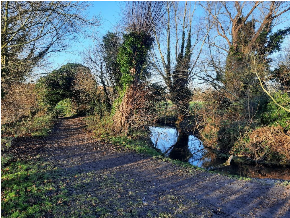
No cutting required upstream of meander.