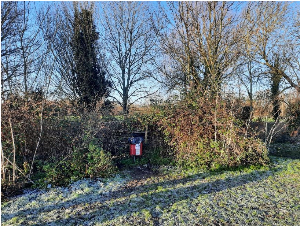
Cut bramble back hard from around waste bin, cut bramble above fence line to prevent it from becoming higher.