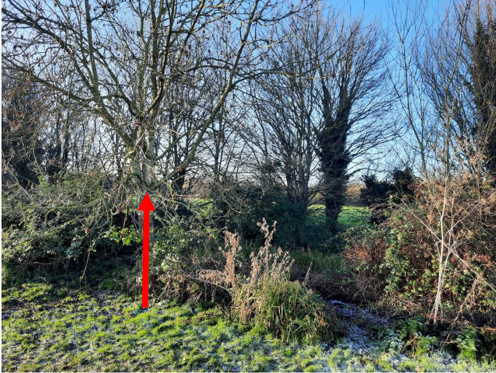
Crown lift ash tree (red arrow), strim/flail cut previously cut bramble at ground level (not the thicket).