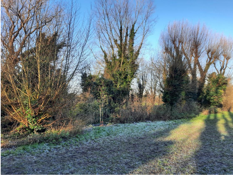
Strim/flail cut from seat to upstream meander. Ensure newly planted alder tree is not damaged.