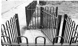
Hooped railings @ a cost of £1850-00