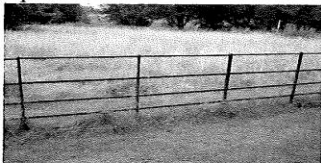
Country park railings @ a cost of £1500-00

Hope this meets with your approval , any questions please don't hesitate to get in touch.